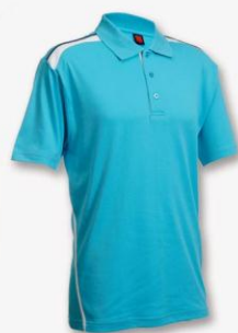
CI 0928 SEA BLUE / WHITE (P/BLACK)