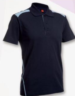
CI 0901 NAVY / LT.BLUE (P/WHITE)