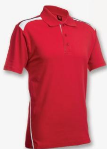
CI 0905 RED / WHITE (P/BLACK)