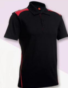
CI 0902 BLACK / RED (P/WHITE)