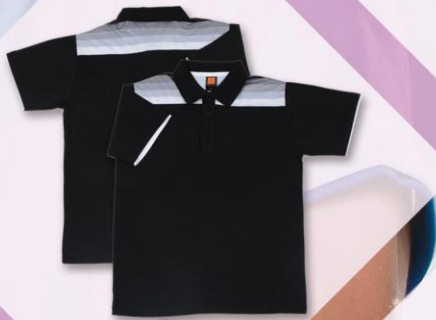
CI 1102 BLACK