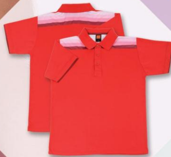
CI 1105 RED