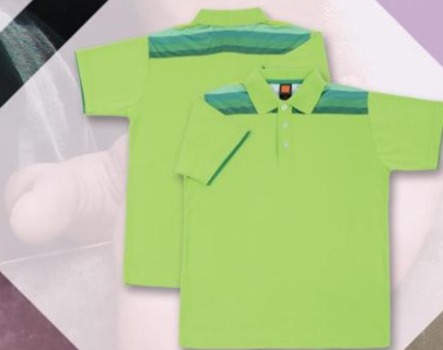
CI 1113 LIME GREEN