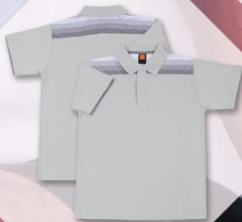
CI 1112 LIGHT GREY