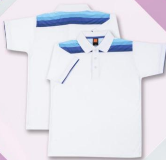
CI 1100 WHITE