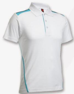
CI 0900 WHITE / SEA BLUE (P/BLACK)