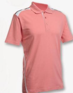
CI 0929 PEACH / WHITE (P/BLACK)